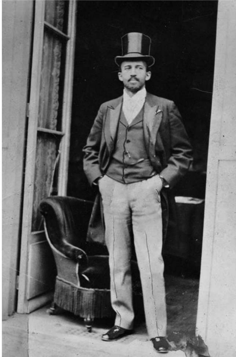
At the Exposition Universelle (Paris World Fair) of 1900, where a “Negro Exposition,” partly organized by Booker T. Washington and Du Bois, aimed to show the world the positive contributions of Black people.