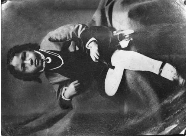
At age 4 (1872)