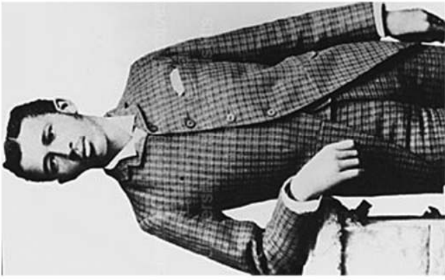
At age 19 (1887)